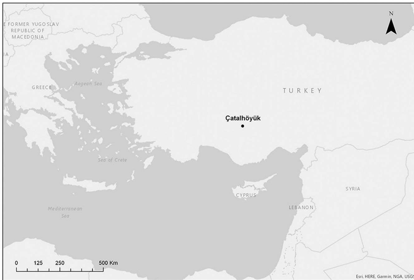
Fig. 1. Regional map of Turkey and the Mediterranean basin showing location of Çatalhöyük.

One such community is Neolithic Çatalhöyük, located in the Konya Plain on the Anatolian plateau of south-central Turkey (Fig. 1). Çatalhöyük includes the material remains of one of the